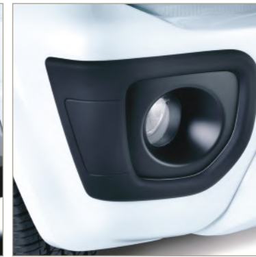
BUMPER CORNER PROTECTOR SET