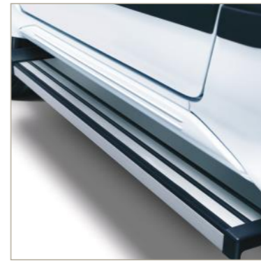
ALUMINIUM RUNNING BOARD

Whether you're down the high street or up a mountain, the Jimny has the versatility to cope. And its range of good-looking, hard-working accessories only makes it better. You'll find all of them on our website. So for once, we're going to suggest you let your fingers do the walking to: suzuki.co.uk/cars/accessories