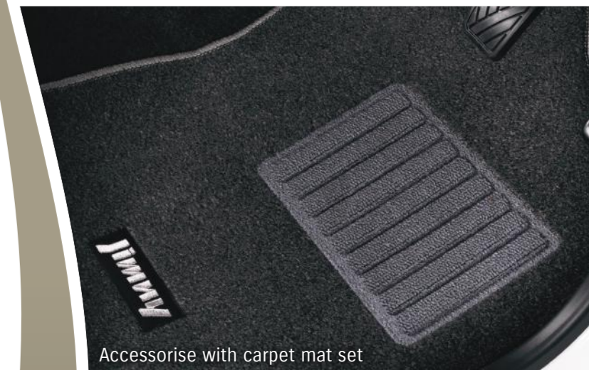
Accessorise with carpet mat set