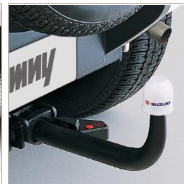
DETACHABLE TOW-BAR ASSEMBLY