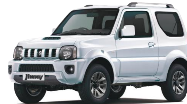
PEARL WHITE METALLIC†