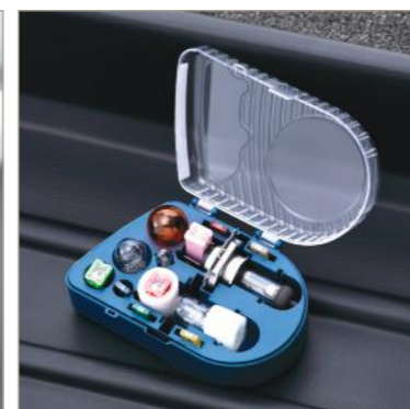
SPARE BULB AND FUSE SET