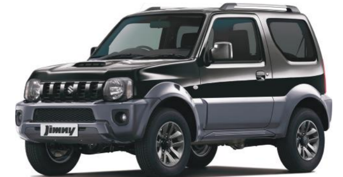
BLUEISH BLACK PEARL METALLIC/ QUASAR GREY 2-TONE†