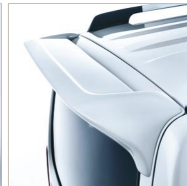
REAR UPPER SPOILER