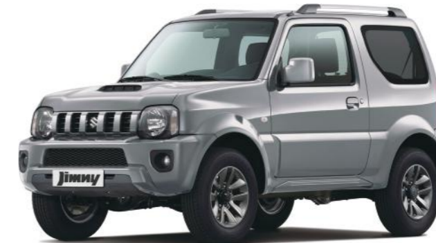
STEEL SILVER METALLIC†