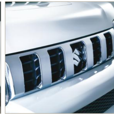
CHROMED FRONT GRILLE TRIM