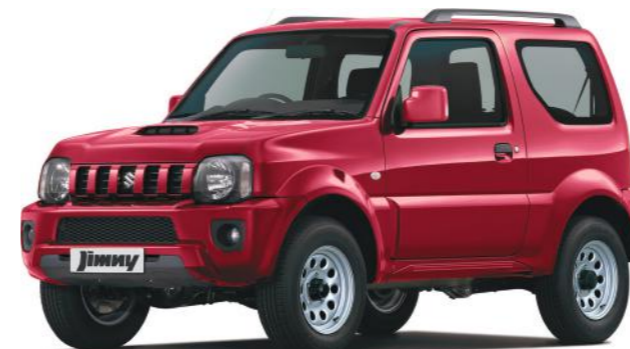
PHOENIX RED PEARL METALLIC*