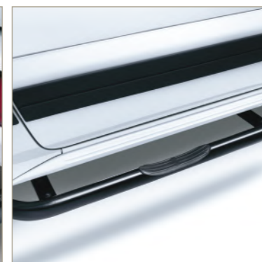
SIDE SPORT BAR SET (BLACK)