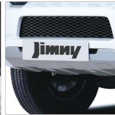
FRONT SKID PLATE