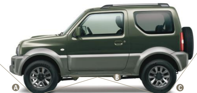
A 34° approach angle (default setting, unloaded Jimny) B 31° ramp breakover angle C 46° departure angle

All year round, the Jimny is a 4x4 designed for adventure. Every time you climb aboard, there's one waiting to happen.