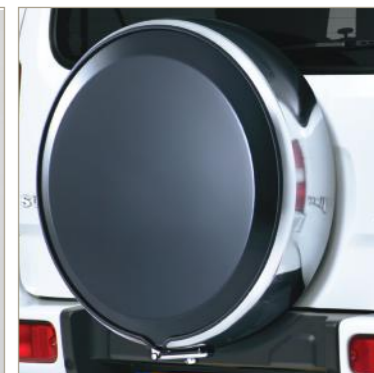
HARD SPARE WHEEL COVER