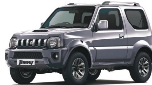
QUASAR GREY METALLIC**