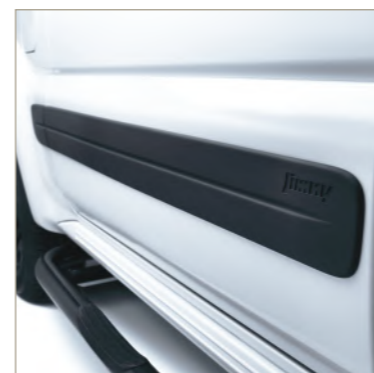
SIDE MOULDING SET