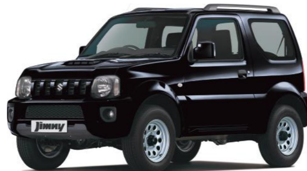
BLUEISH BLACK PEARL METALLIC*