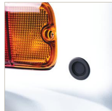
REVERSING AID SENSOR SET