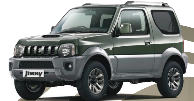
KHAKI GREEN METALLIC/ QUASAR GREY 2-TONE†