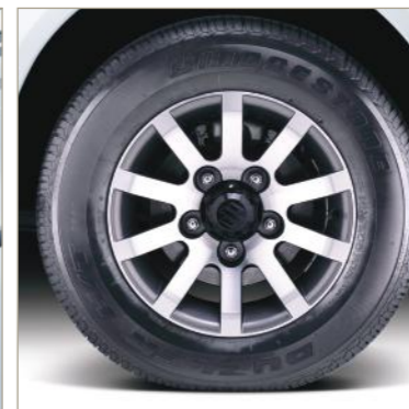
'DAKAR' ALLOY WHEEL