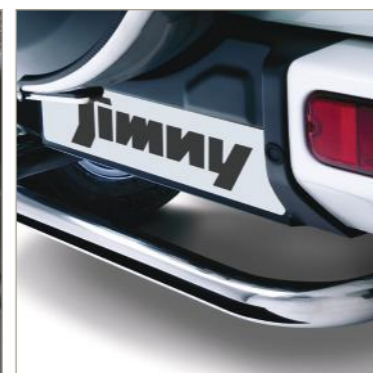
CHROMED REAR SPORT BAR